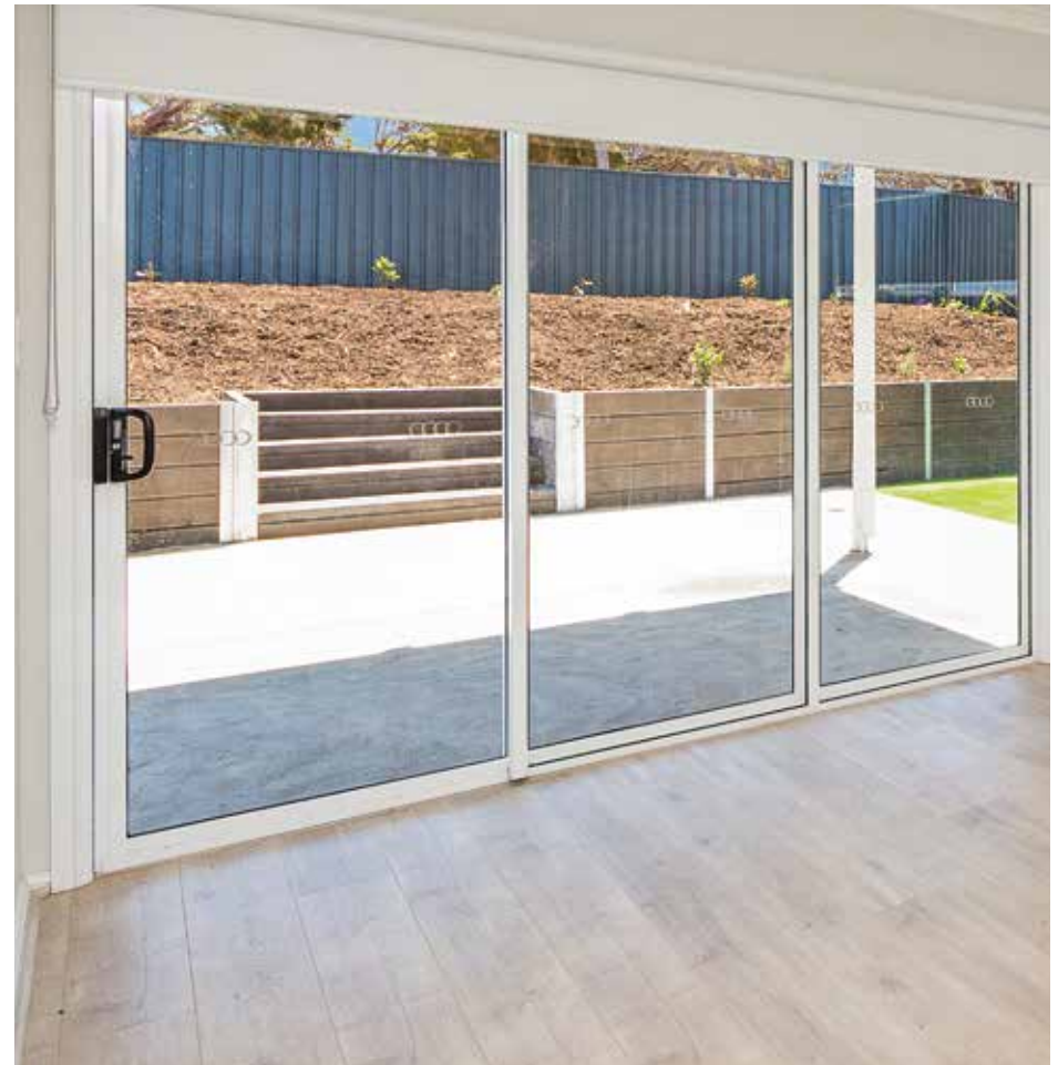
Lower terraced retaining walls is better than larger expensive walls

Construction of a series of lower terraced retaining walls is a preferred solution to constructing large walls. This construction method is often cheaper, removing the need for technical engineering calculations. Any retaining walls 1.0m high or greater will require council approval. Retaining walls should be constructed of materials that complement the natural environment such as stone or feature rock, feature exposed or rendered brick, interlocking feature panels such as treated concrete sleepers or feature timber.