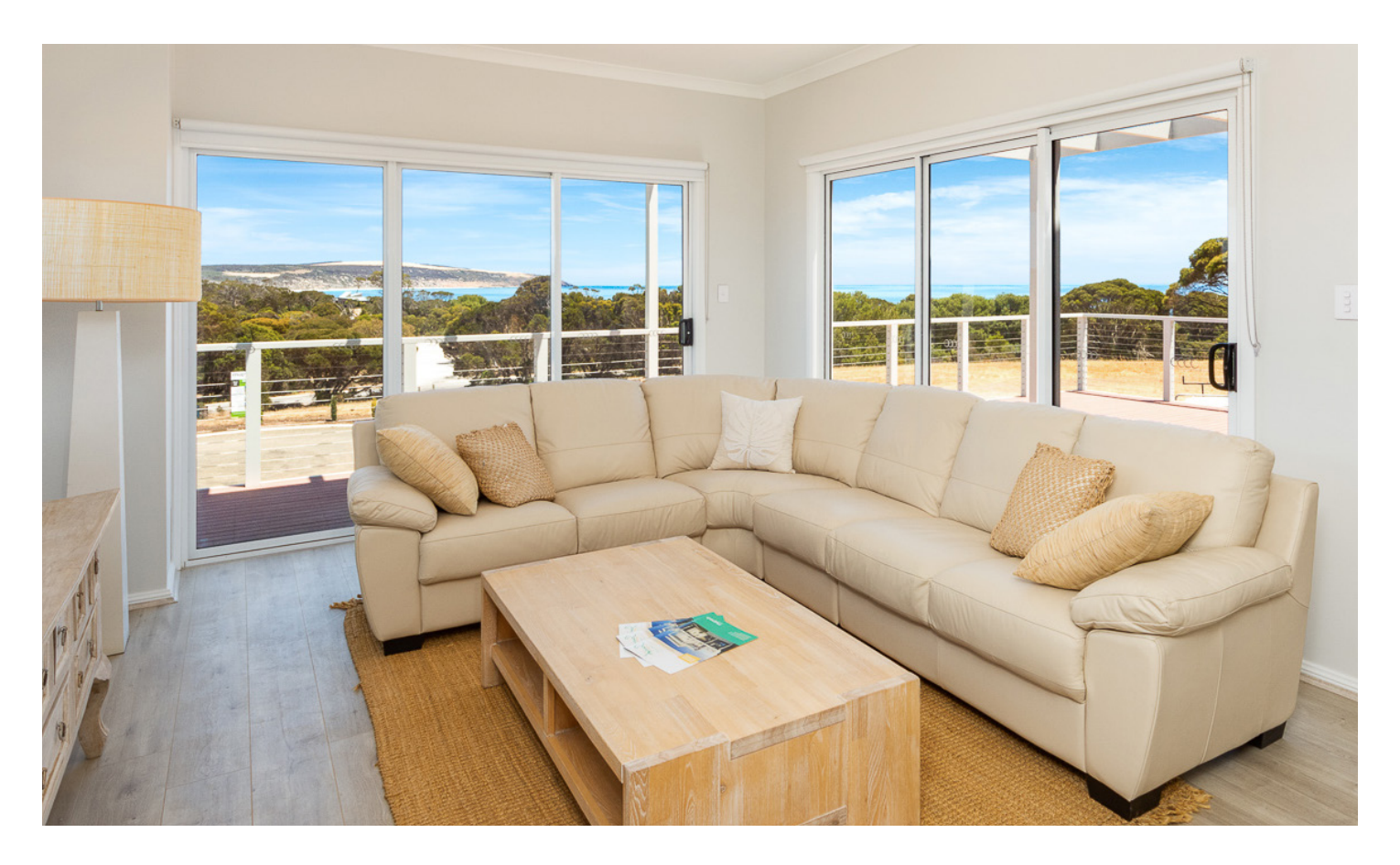
The house image is called 'The Verto' and is a house and land package available for sale for $694,000 'fully furnished'. 43 Salty Air Circuit Seaside Emu Bay.